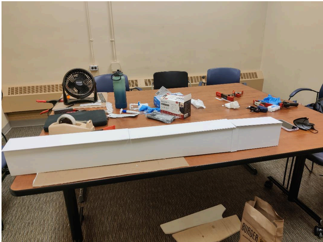
Figure 1. Wide body shot of Team 701's bridge.

The following figure is a wide-body shot of our bridge.